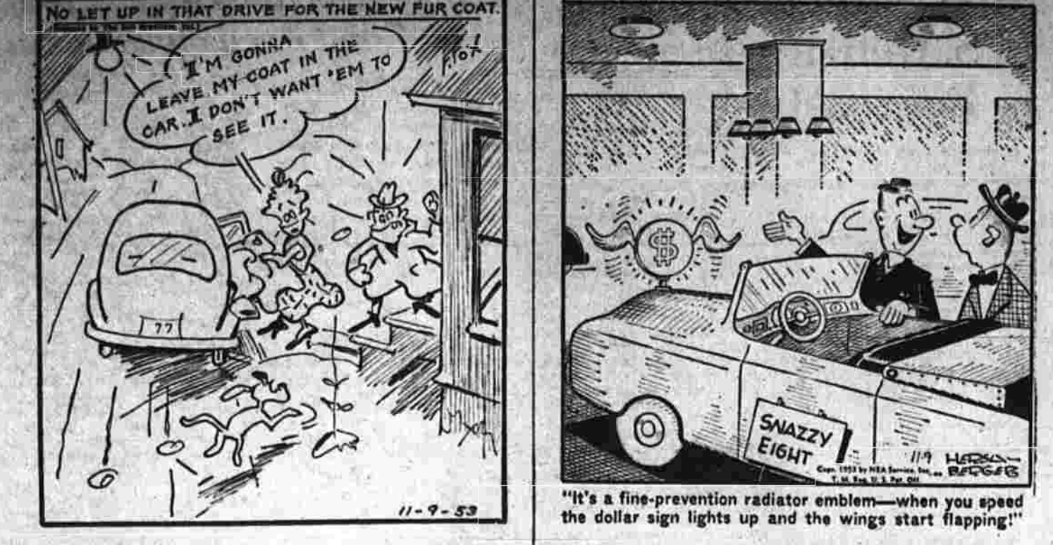
"It's a fine-vention radiator emblem—when you speed the dollar sign lights up and the wings start flapping!"